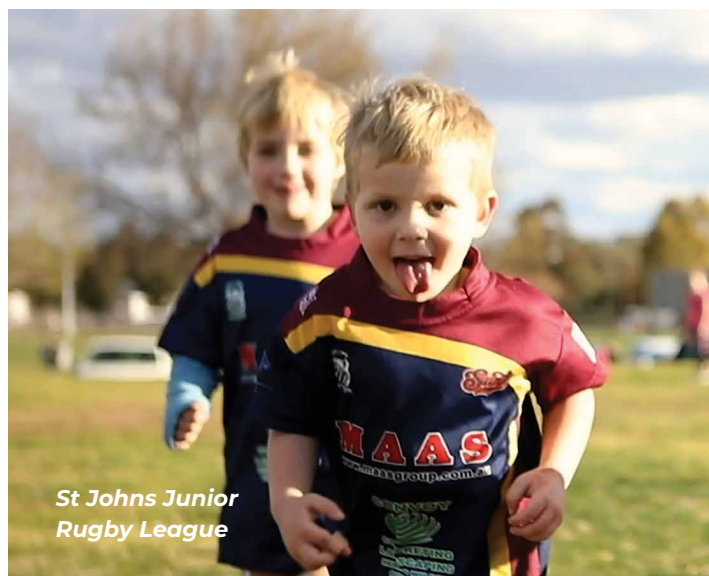
St Johns Junior Rugby League