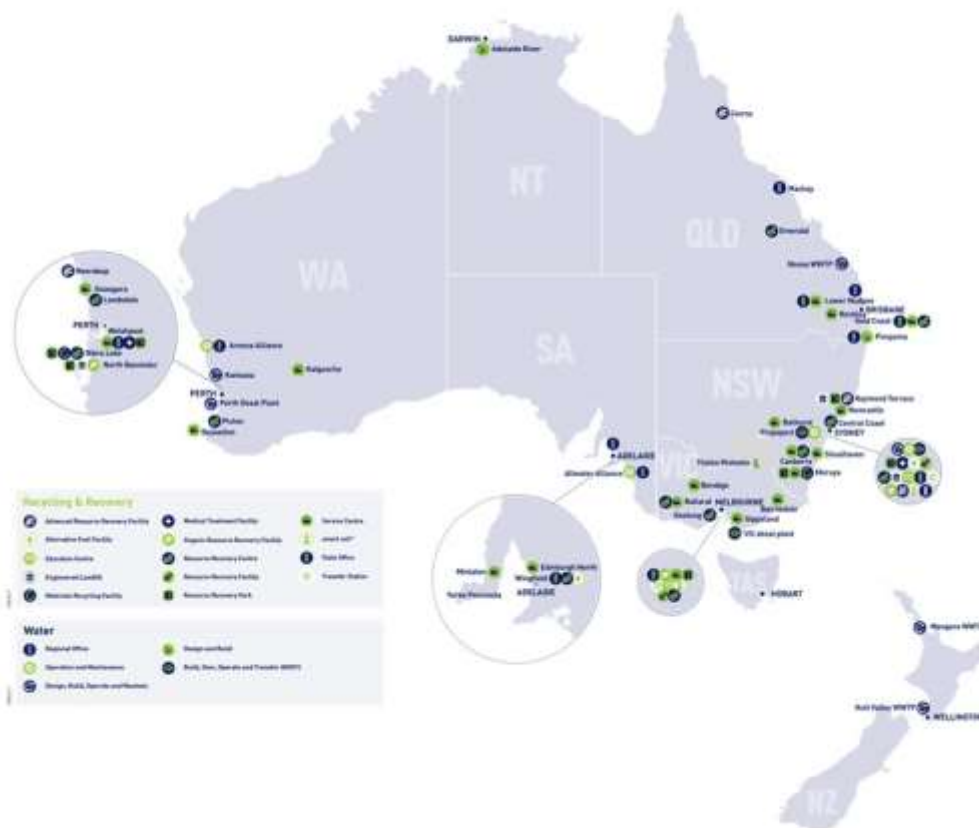
SUEZ Recycling & Recovery and Water facilities map

More information about our business can be found at www.suez.com.au .