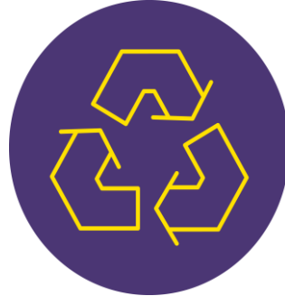
Recycling & Return Services

ANC's supply chain involves working with a number of large Australian and global clients providing professional last mile delivery services into homes, offices and worksites including construction, corporate, medical and education facilities. As part of our integrated delivery service, we provide 'complex deliveries' such as installation, assembly and removal of old comparable goods.