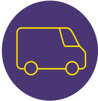
Brand carry & Promotion