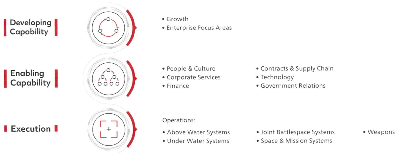
Figure 2: Raytheon Australia business structure

Raytheon Australia is structured for delivery and growth and is organised into three groups: