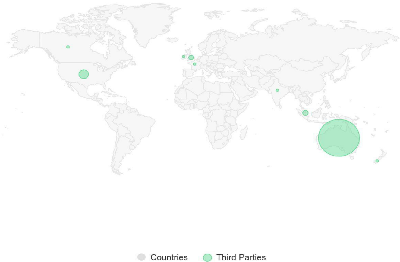
Third Parties By Countries

The Business NSW Group’s supply chain is largely domestic, with most suppliers registered and primarily operating within Australia: