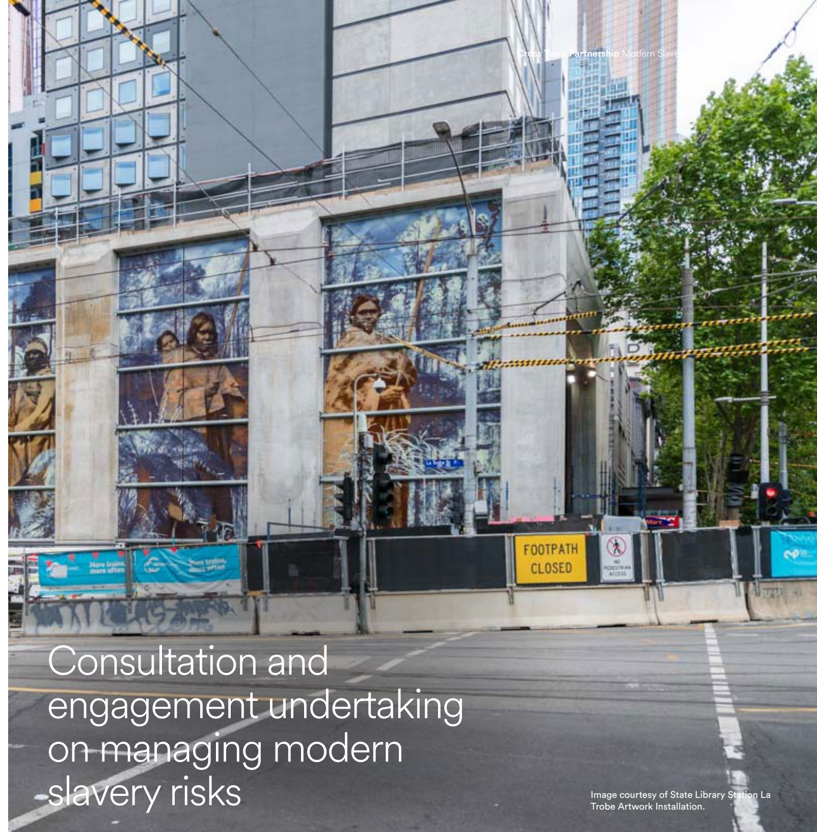
Image courtesy of State Library Station La Trobe Artwork Installation.

CYP has considered modern slavery issues in its risk framework to ensure accountability and oversight of mitigation approaches by its leadership team and the CYP Partnership Committee.