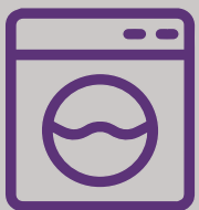
Linen and Laundry