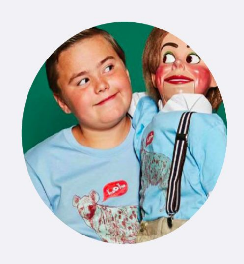
Giving back: Inspiring good for people and the environment