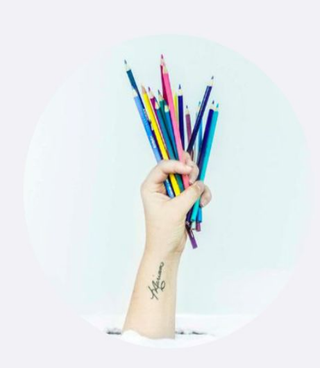
Redbubble: Our business model & supporting Artists