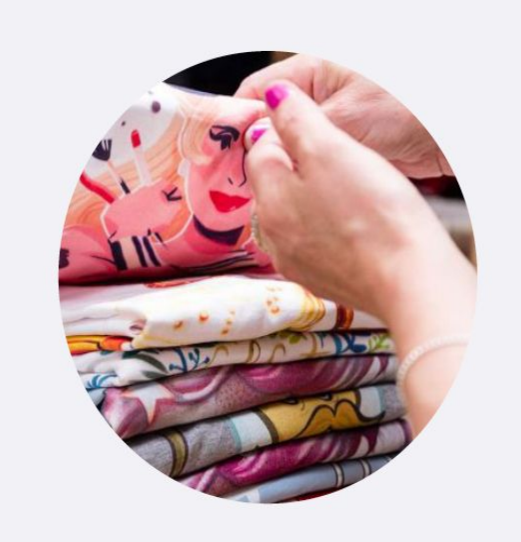
Global Operations: Living our values in our supply chain network