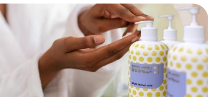
Personal Care & Beauty