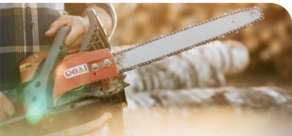
Durables & Technical