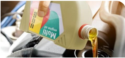
Automotive & Chemicals