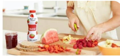
Food & Dairy