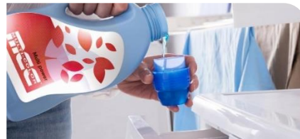
Home Care & Laundry