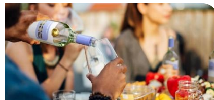
Wine & Spirit