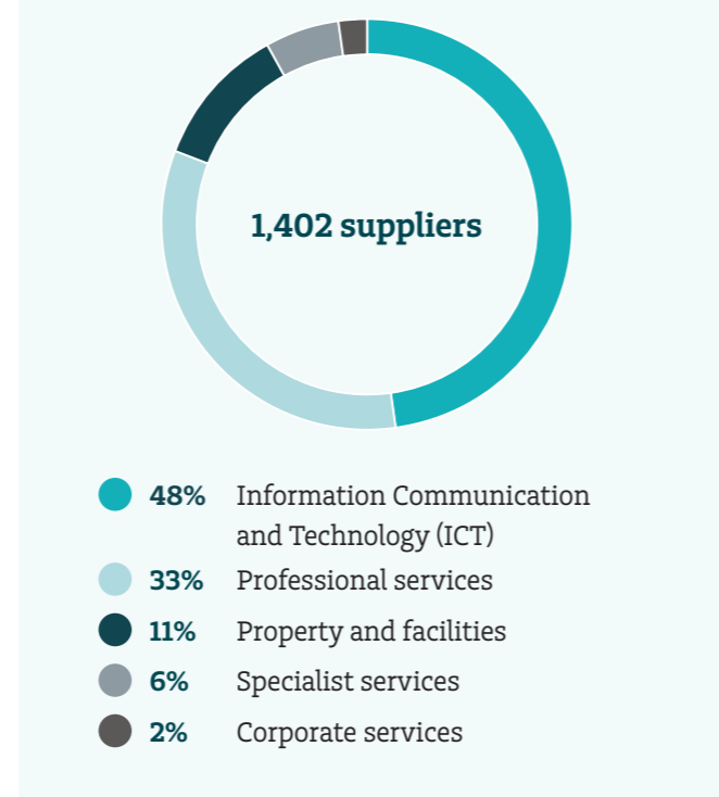
Figure 1 MLC Limited supplier distribution by category (2023)

MLC Limited uses 1,402 suppliers, with only a small number of material 3 outsourcing arrangements – predominantly technology services – delivered from offshore. These services are performed by five Indian suppliers and one from Vietnam.