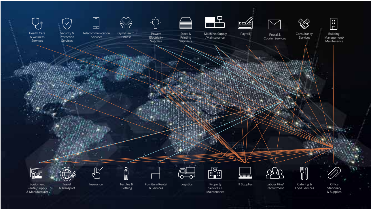
Supply Chain Map 2022-2023 - Fujifilm DMS suppliers

The map below provides a general indication of the risks associated with certain goods and services that has been determined based on an analysis of the geographic origins, the industry or sector associated with the goods or services, the raw materials and extended supply chain risks traditionally associated with the goods or services which will be discussed further in this Statement: