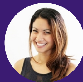
Melanie Perkins Canva Co-Founder and CEO

“I think with running such a large company with such a significant valuation now, it's an obligation on us to use that to be a force for good and make the world a better place.”