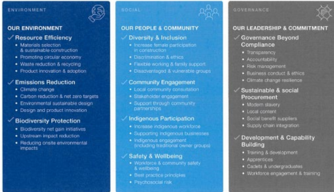
Figure 2 – BESIX Watpac National Sustainability Framework Sub-topics.