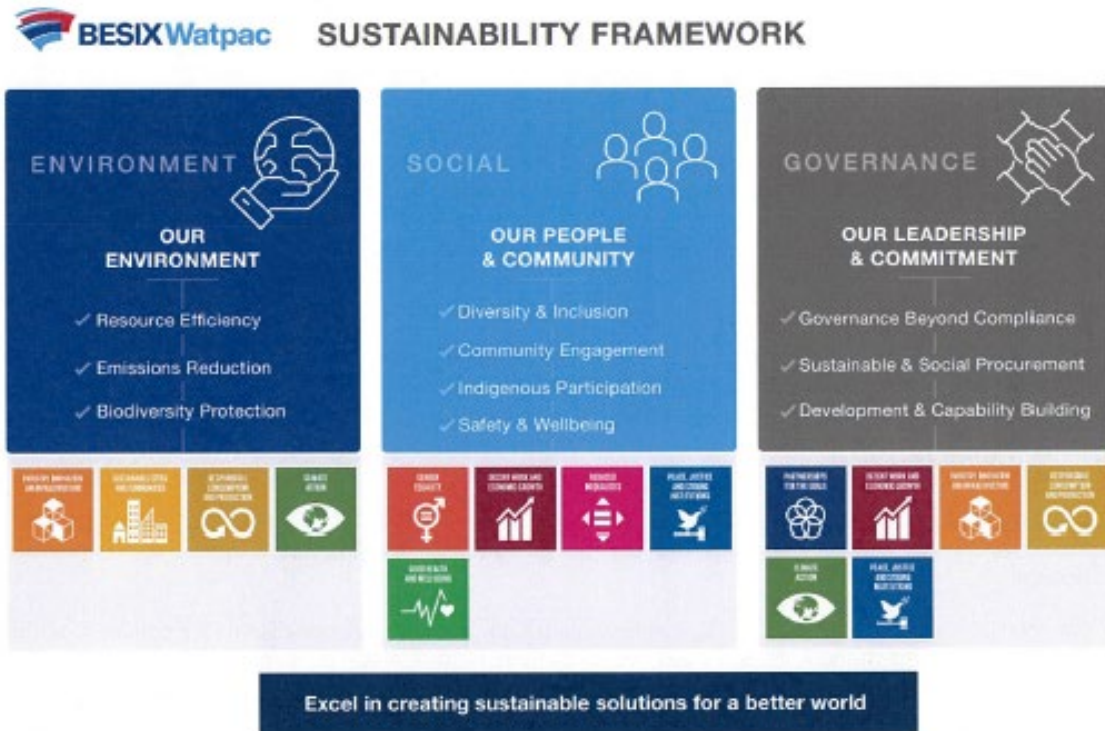
Figure 1 – BESIX Watpac National Sustainability Framework

BESIX Watpac's Modern Slavery Policy forms part of its National Sustainability Framework. BESIX Watpac is committed to delivering on the key focus topics as shown in Figure 1 which are aligned to United Nations Sustainable Development Goals. These key topics are comprised of sub-topics that includes Modern Slavery under the 'Our Leadership and Commitment' pillar as shown in Figure 2.