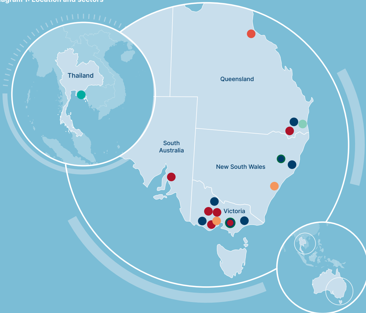
Diagram 1: Location and sectors