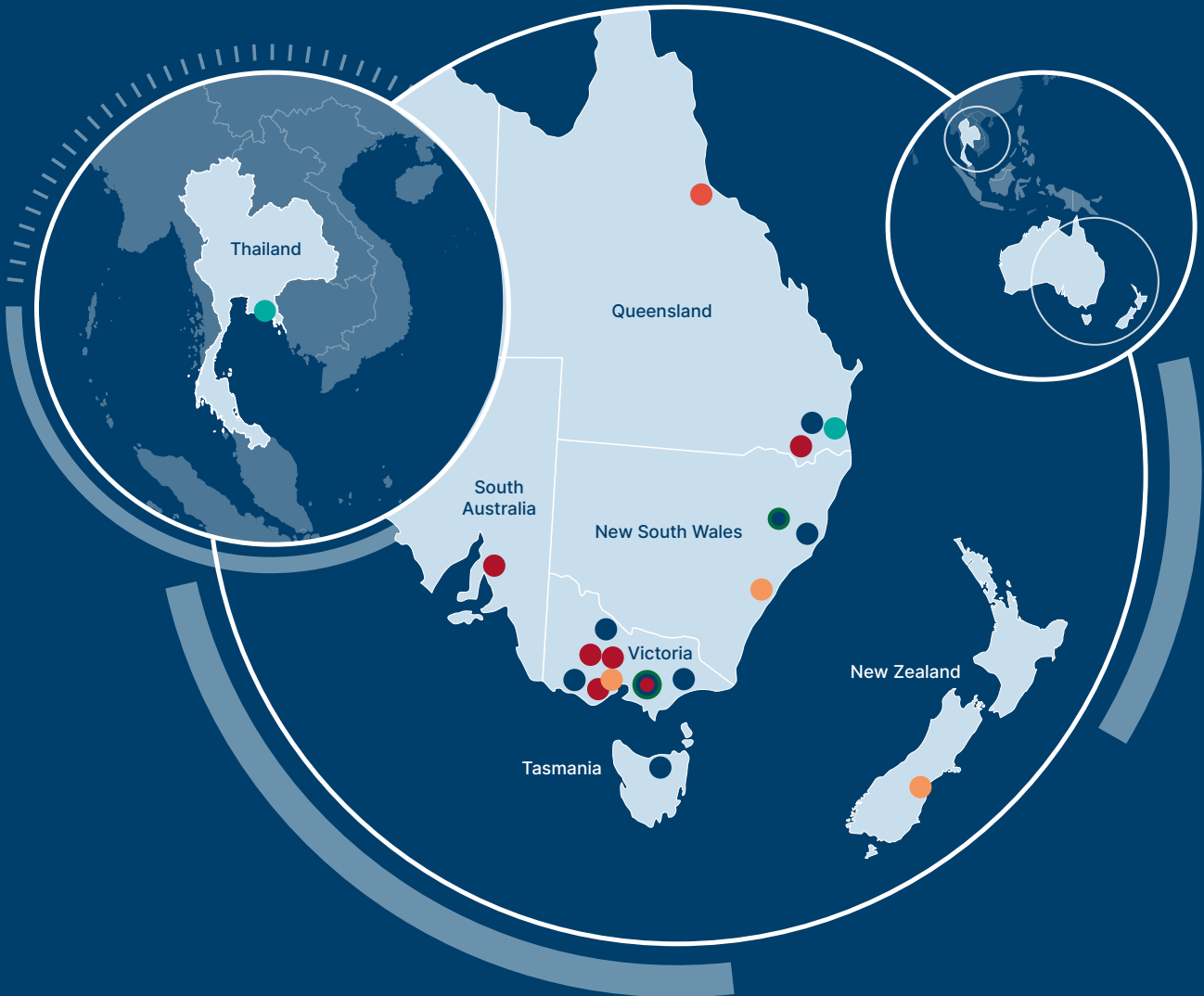
Diagram 1: Location and sectors