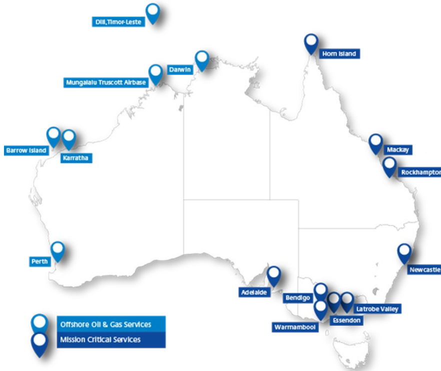
Figure 3 - Aviation operations map