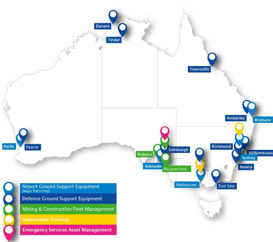
Figure 2 - Land operations map