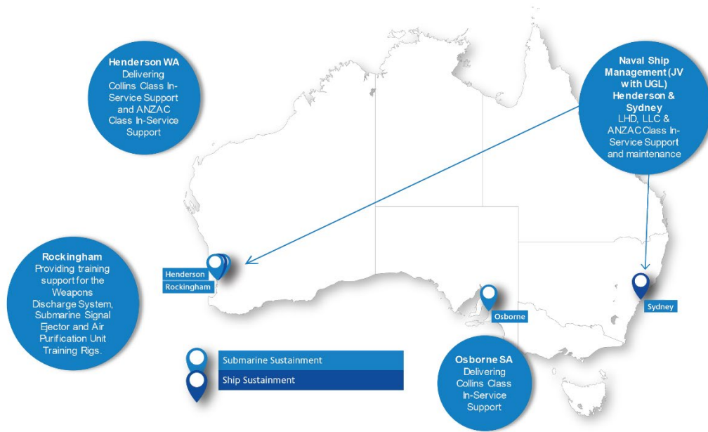
Figure 1 - Marine operations map