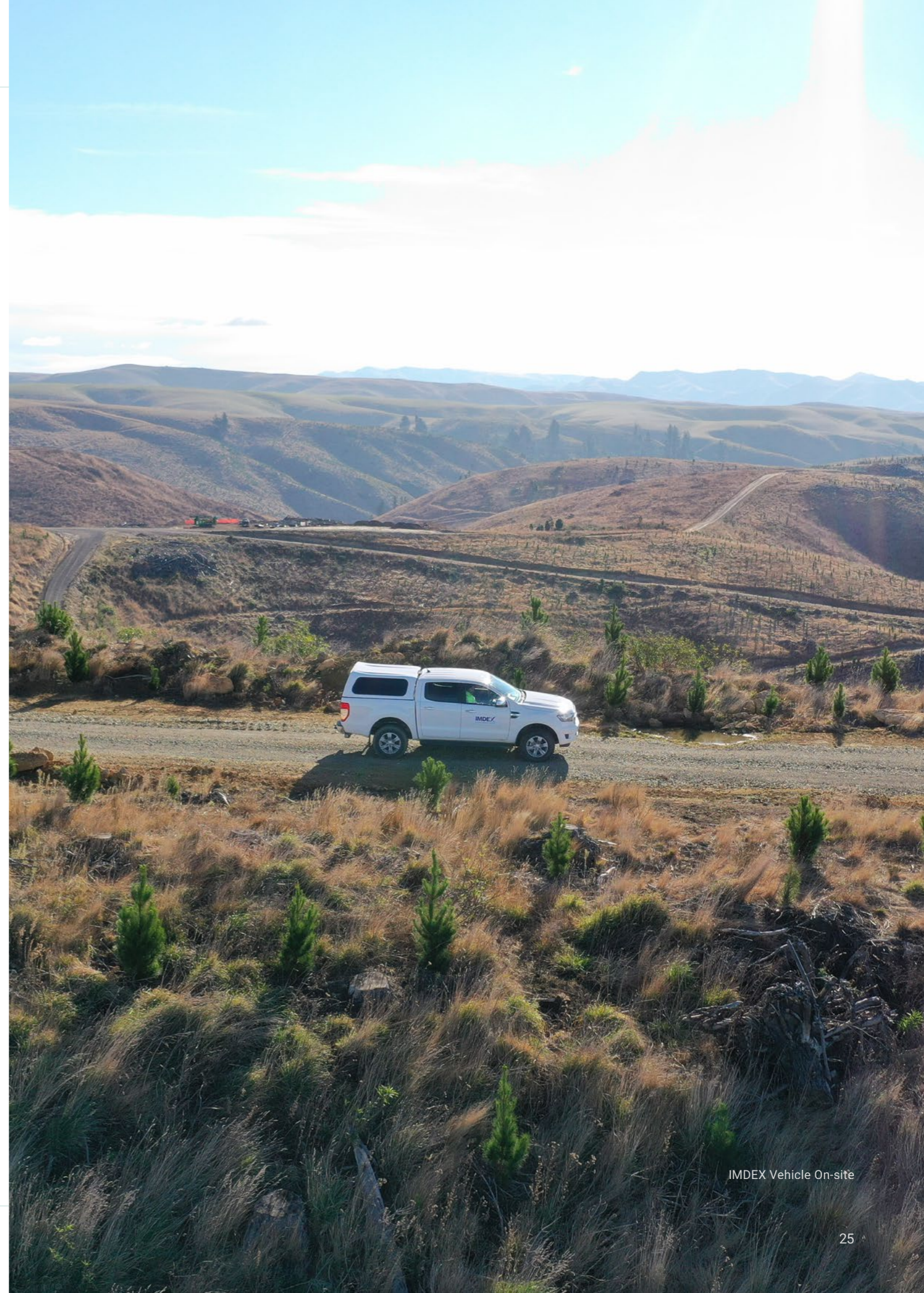
IMDEX Vehicle On-site

Monitoring of effectiveness and selection of continuous improvement initiatives is done by our Legal, Risk & Compliance Team and executives. Top-level oversight and direction are provided by the Audit, Risk & Compliance Committee and Sustainability Committee of the Imdex Limited board.