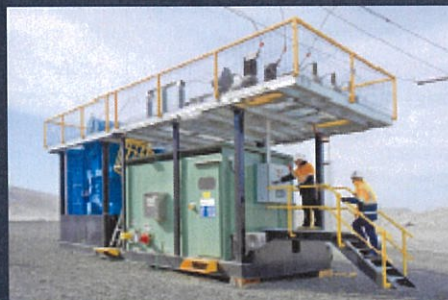
Mining and Resources