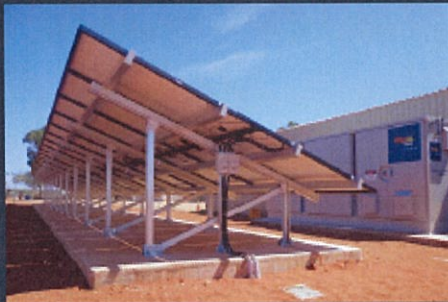
Renewables and Power

We specialise in the design and supply of complete solutions with a focus on electrical and control applications