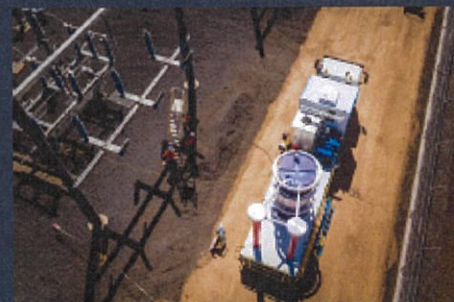
Industrial and Commercial