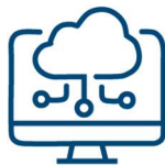
Information Technology (hardware and software)