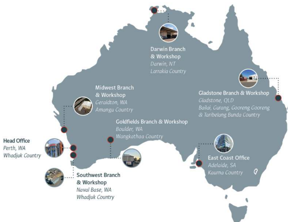
Figure 4: Australian operations

In Australia, we have a team of over 1,400, and five offices across the country located in Perth (Head Office), Naval Base, Geraldton, Kalgoorlie, Adelaide, Darwin and Gladstone as well as fully equipped workshop facilities located in Naval Base, Kalgoorlie, Geraldton, Darwin and Gladstone to support our site-based teams.