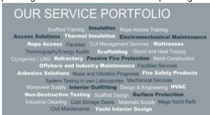
Figure 3: KAEFER and KAEFER Australia Services Portfolio

KAEFER Australia has an established and widespread presence across Australia, operating in the country for 40 years. KAEFER was established in Bremen, Germany in 1918, initially providing insulation services to the local shipbuilding industry. The company has since developed