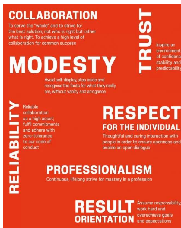
Figure 1: Our KAEFER values

We recognise that our industry harbours inherent modern slavery risks and we take responsibility for doing our part to better understand and address those risks. At KAEFER we see our approach to tackling modern slavery risks as rooted in our commitment to treating all our stakeholders with dignity and respect. This commitment is a key part of our values and extends to all our employees, clients, business partners, contractors and the communities in which we are active. Furthermore, we believe we have a responsibility to promote good practices and support human rights around the world.