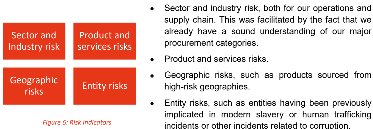
Figure 6: Risk Indicators

KAEFER Australia’s review was based on the following indicators, which are also guiding our detailed risk assessment: