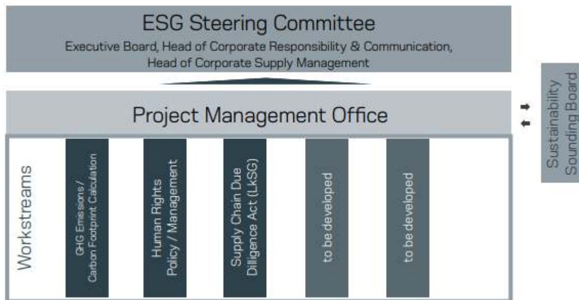
Figure 7: KAEFER Group (global) sustainability governance

One of the objectives for KAEFER Australia going forward will be to formalise local governance of our response by assigning responsibility at the management level, drawing on cross-functional input locally (e.g., involving Human Resources etc.), and formalising modern slavery response as a Board agenda item at regular intervals. We also intend to take action to ensure we best leverage the global structures in place, whilst still recognising that different regions may require unique responses to meet compliance requirements or address risks specific to that region.