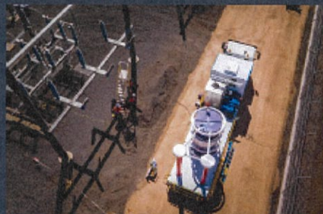
Industrial and Commercial