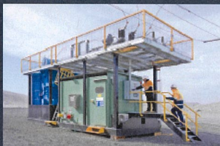
Mining and Resources