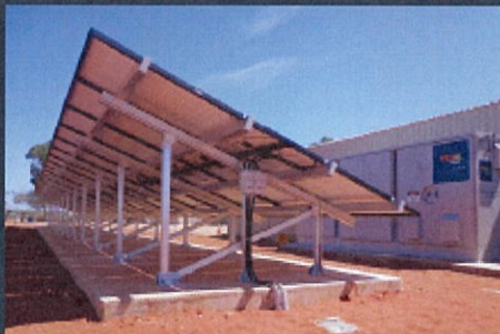
Renewables and Power

We specialise in the design and supply of complete solutions with a focus on electrical and control applications