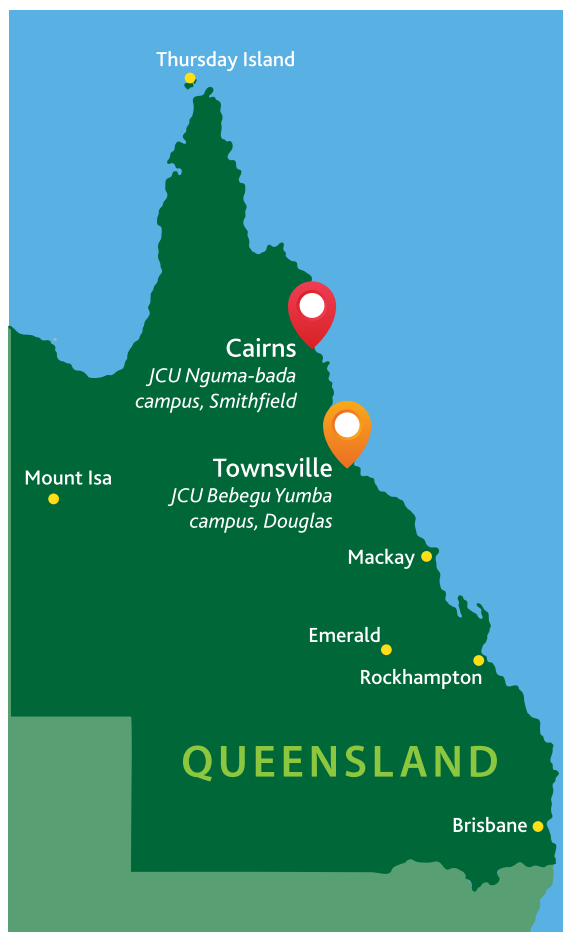
Map of JCU campus locations in Queensland