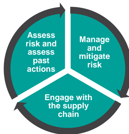
Graphic 2: Modern Slavery Compliance Cycle