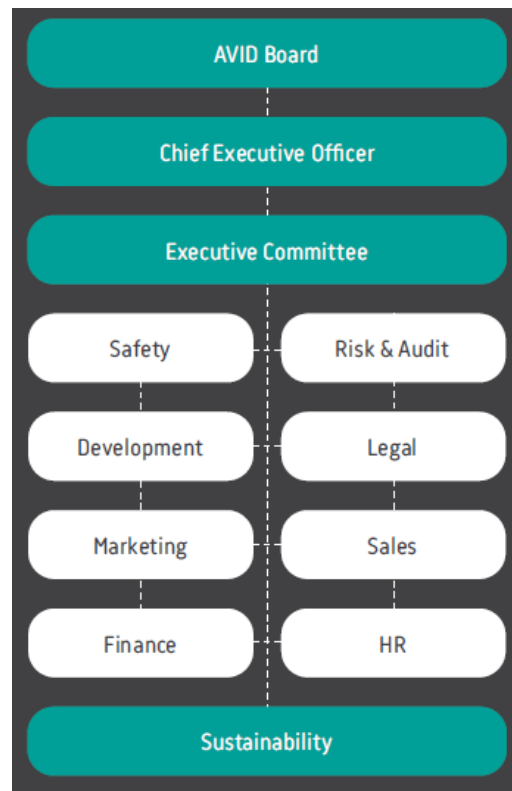
Graphic 1: AVID's Corporate Governance Structure

Our key policies relevant to modern slavery are:-