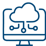
Information Technology (hardware and software)