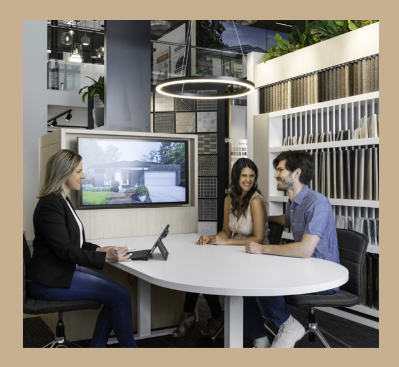
DENNIS FAMILY HOLDINGS 23 | 24 MODERN SLAVERY REPORT PAGE 4