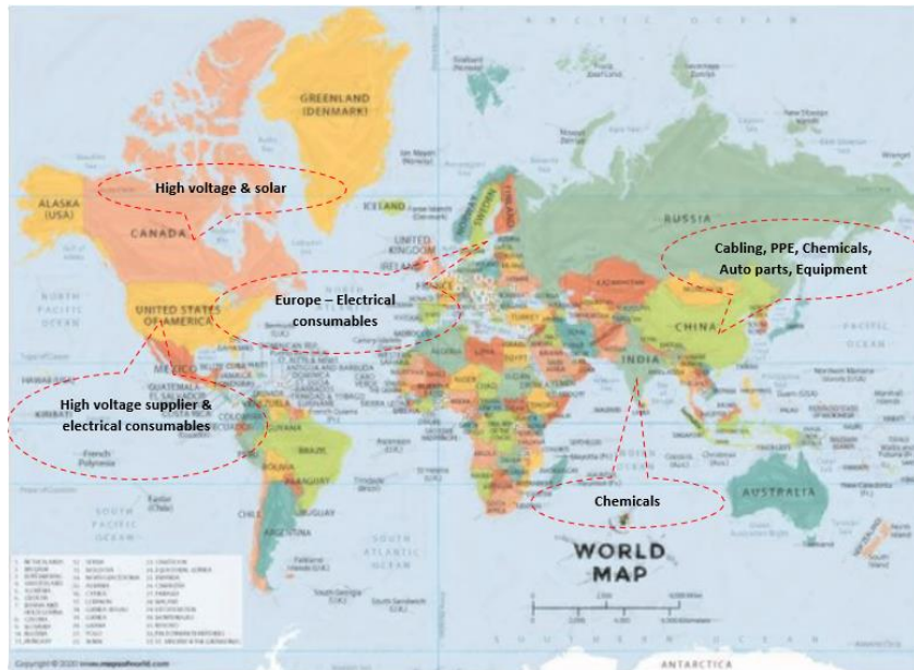
Citywide, via a supplier questionnaire, learnt that materials are either directly or indirectly procured through countries with high exposure to slavery practices and others that are less likely.

In addition, we have identified the use of services managed by third party providers, such as contractors, consultancy and labour hire companies, may be a potential risk area if these parties are not in compliance with workplace legislation and standards.