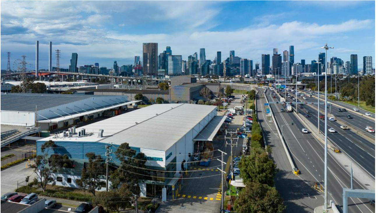
Figure 1 Siemens Mobility Manufacturing Facility in Port Melbourne, Victoria, Australia.