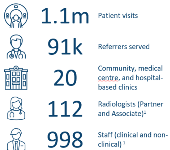
Figure 1: PRC in FY23

The images are read by our highly-trained sub-specialty radiologists who report their findings back to the referrer.