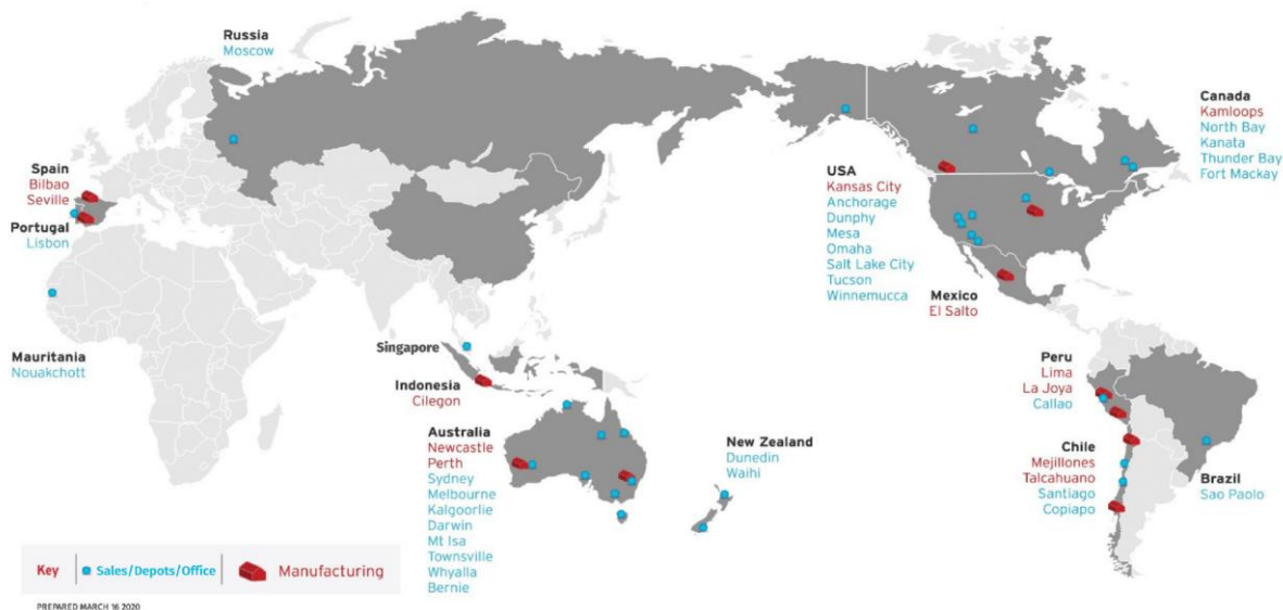
Figure 1: Overview of Molycop corporate group global operations and locations

Each region operates with a degree of autonomy but with shared resources (such as global support teams, policies and procedures) and common senior leadership structures to ensure consistency in functionality and coordination of activities.