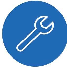
TOOLS AND EQUIPMENT