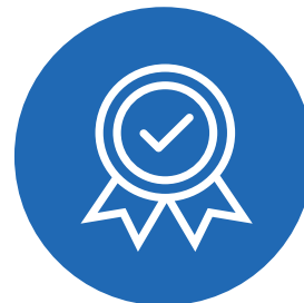
PROFESSIONAL SERVICES AND CONSULTANTS