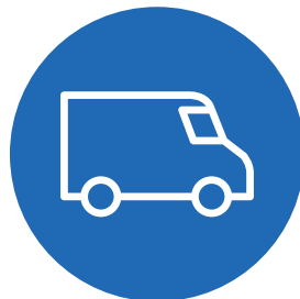
TRANSPORT AND FREIGHT