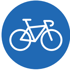
BICYCLES AND BICYCLE RELATED PRODUCTS FOR RESALE

The Group's supply chains include the various goods and services it procures that contribute to the services and products the group sells. The goods and services that we procure fall into the following categories: