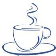
Cafes and Restaurants

Cadell Food Service operates in wholesale food distribution, serving 2500+ clients across diverse food service establishments, including: