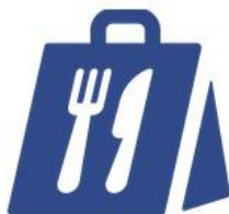
Fast Food & Pizza Shops