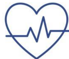
Health & Age Care