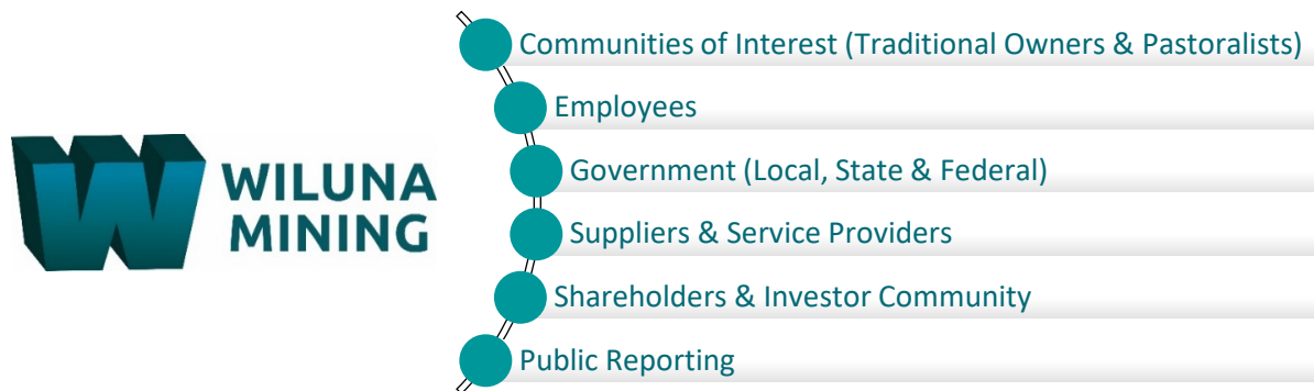
Figure 3 Stakeholders

Wiluna Mining considers the interests of its stakeholders and some with a keen interest in Human Rights, or actions to prevent Modern Slavery (Figure 3). This may occur via regular meetings or through informal contact.