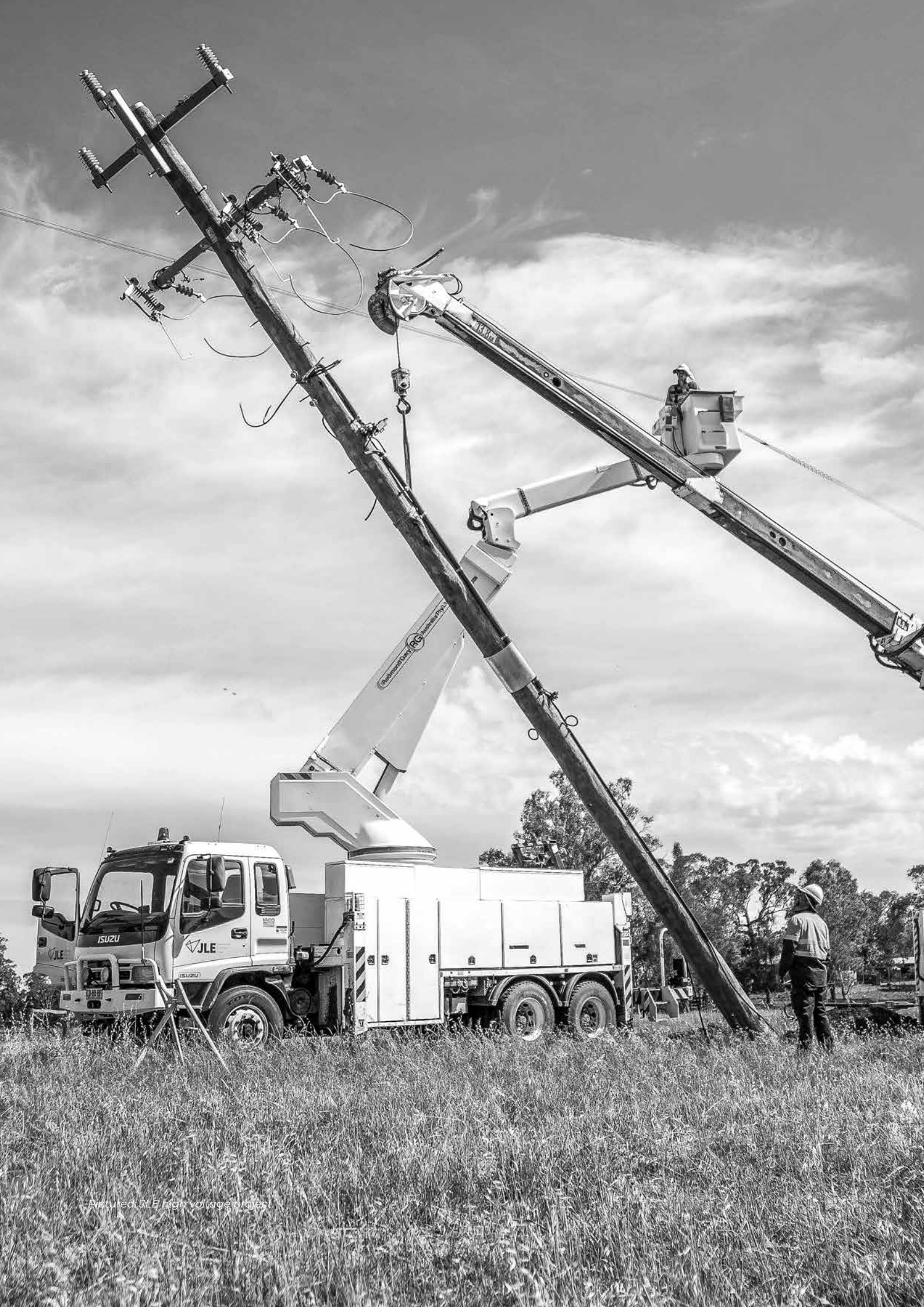
Articulated JLE high voltage cranes