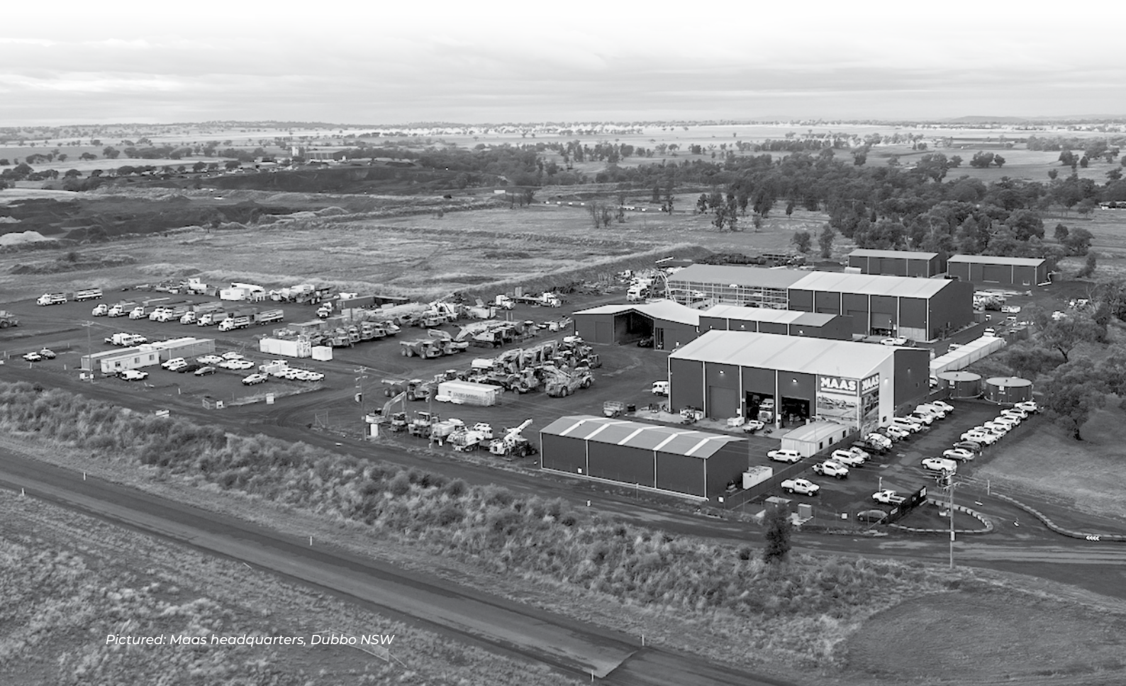
Pictured: Maas headquarters, Dubbo NSW