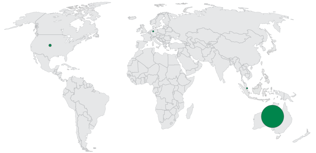
Figure 1: VicTrack Third Party Suppliers by Country of Origin (Tier One)

The below map indicates advice provided by suppliers for 2022–23 of Tier One location.