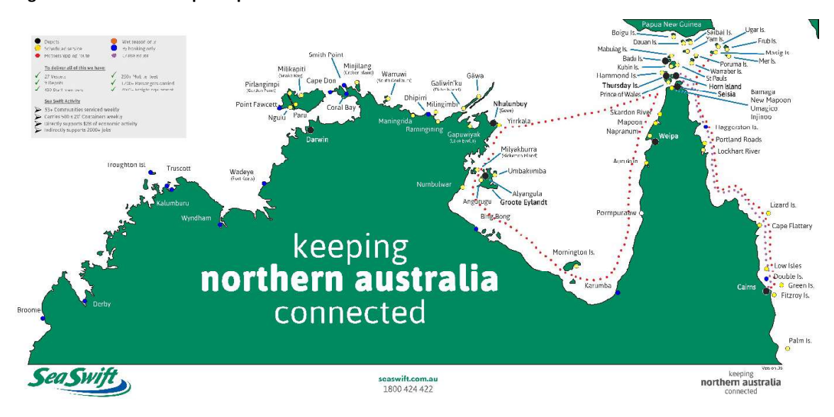
Figure 1: Sea Swift Group footprint

Sea Swift manages and operates a fleet of 27 vessels servicing the area of operation and has used approximately 700 direct suppliers, which are predominantly located in Australia. Sea Swift also continues to engage with suppliers in other countries such as Indonesia, Singapore and United States.