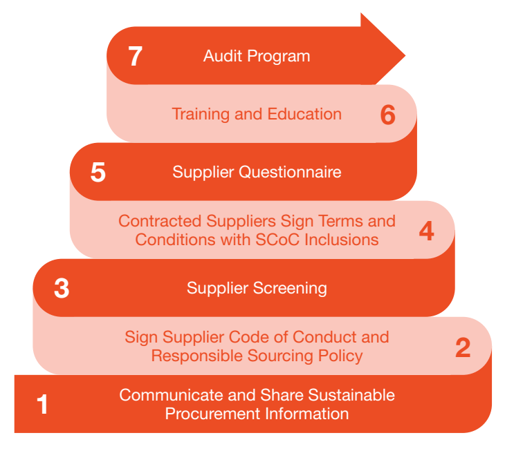
Figure 2: BINGO's Due Diligence Framework

We mapped our key stakeholders to identify who we need to