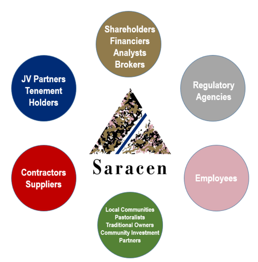
Figure 2: Stakeholder Diagram

Saracen's stakeholders are illustrated in the diagram below. Saracen regularly communicates with internal and external stakeholders on Saracen's commitment and obligation to minimise the risk of modern slavery and human trafficking in its operations including through contractual arrangements and procurement processes. Saracen believes that full transparency and clear communication with our stakeholders, depicted in the figure below, can drive affirmative change towards the eradication of modern slavery.