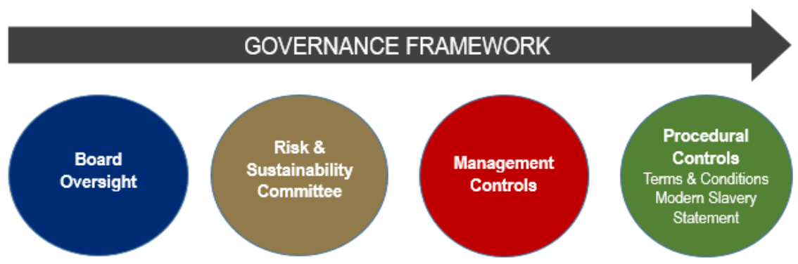
Figure 1: Modern Slavery Governance Framework

Saracen's stakeholders are illustrated in the diagram below. Saracen regularly communicates with internal and external stakeholders on Saracen's commitment and obligation to minimise the risk of modern slavery and human trafficking in its operations including through contractual arrangements and procurement processes. Saracen believes that full transparency and clear communication with our stakeholders, depicted in the figure below, can drive affirmative change towards the eradication of modern slavery.