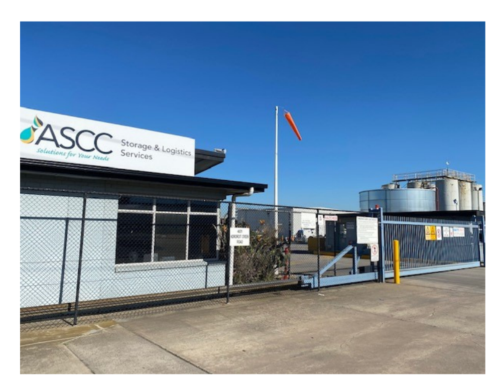
ASCC Australia Terminal Facility as located in Altona, Victoria

To strengthen our ability to adequately assess our supplier base, ASCC has partnered with Ecovadis, the world's largest and most trusted provider of business sustainability ratings for global supply chains. The criteria used by Ecovadis covers four categories including environment, labour and human rights, ethics and sustainable procurement. They follow verifiable international Corporate Social Responsibility standards including Global Company Principles, International Labour Organisation conventions, the Global Reporting Initiative Standard and ISO 26000. ASCC also partners with Avetta, a supply chain compliance solution for organisations who need assurance that their service providers conform to industry Health, Safety & Environment standards.