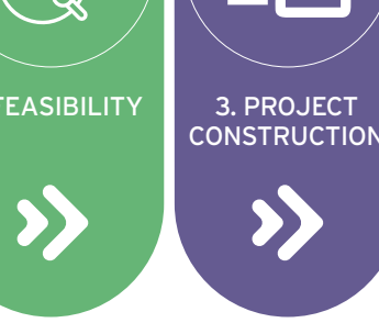
OUR VALUE CHAIN