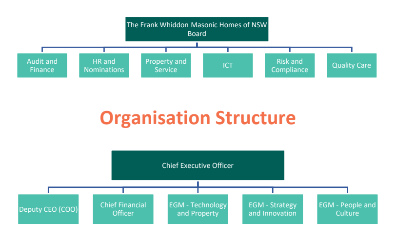
Figure 2. Whiddon Governance Structure