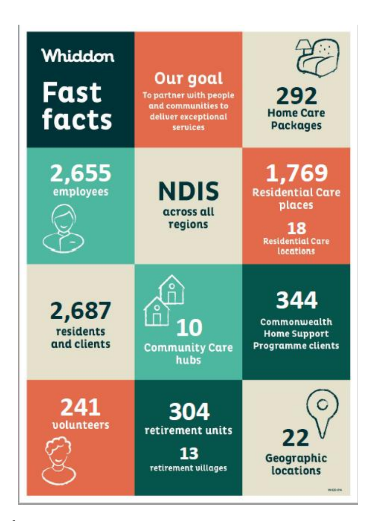
Figure 3 – Whiddon facts

Our strong presence in regional, rural and remote NSW and QLD sets us at the heart of local communities, both as an employer and aged care provider. We actively promote and maintain a proud sense of community – wherever we are, everyone matters.