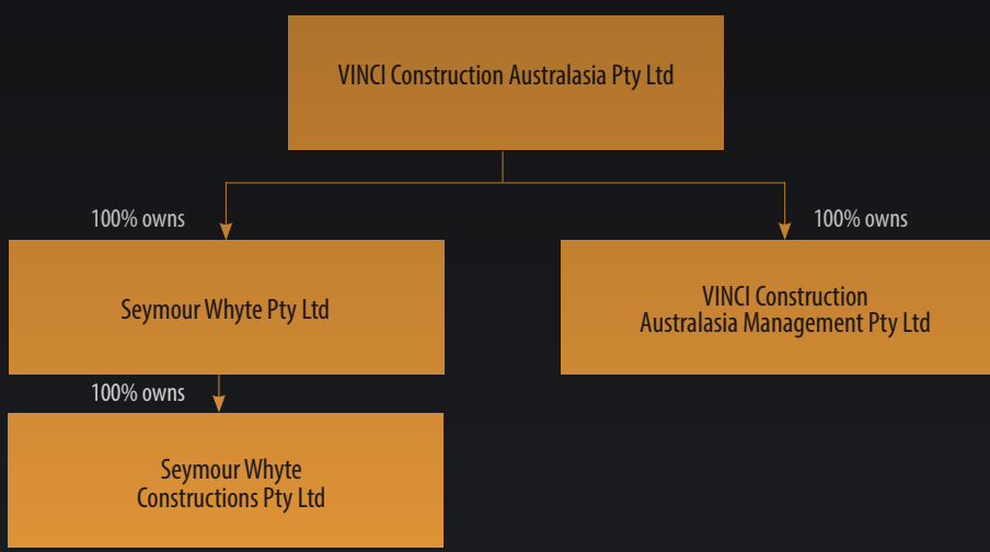
Figure 1. Seymour Whyte corporate structure

Each of the Seymour Whyte reporting entities are private companies. The corporate structure is set out in the figure and table below.