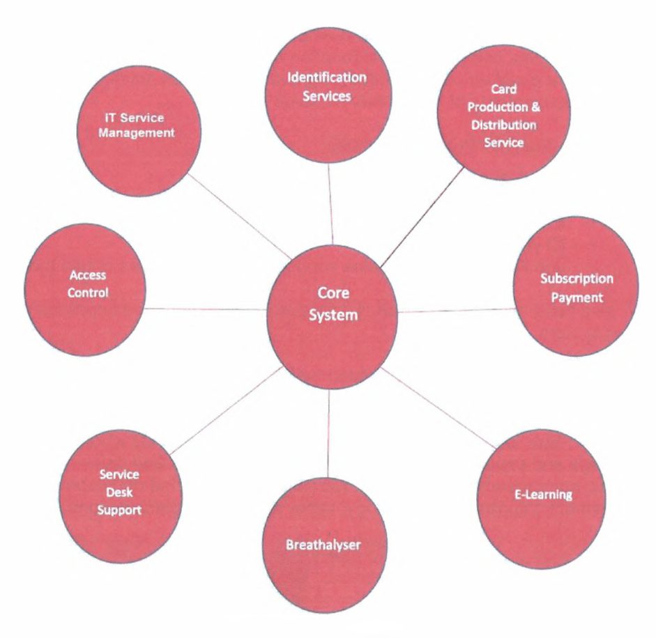
Figure 1: RIW Program - Goods and Services provided by Suppliers

MTA has engaged a number of suppliers to deliver the overall RIW Program and these are shown in Figure 1 below: