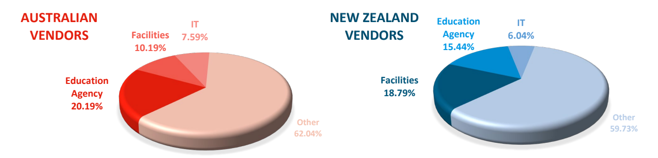
Pie chart of 3 largest vendor categories

SGANZ's largest vendor categories are shown in the pie charts below.