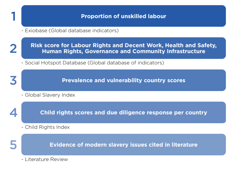
Figure 1: Indicators considered as part of BINGO's supply chain modern slavery risk assessment

BINGO's has 1,159 employees, 110 are casual and six are contractors, whilst the remaining 1,043 are permanent. Our employees span across NSW, Victoria and Queensland. Our employees undertake a range of functions from corporate support, operations at our sites including working at our plants sorting and operating machinery, driving vehicles across our 380 strong fleet and manufacturing bins for our TORO brand.