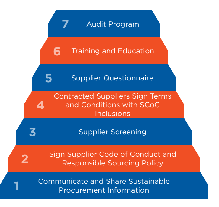
Figure 2: BINGO's due diligence framework