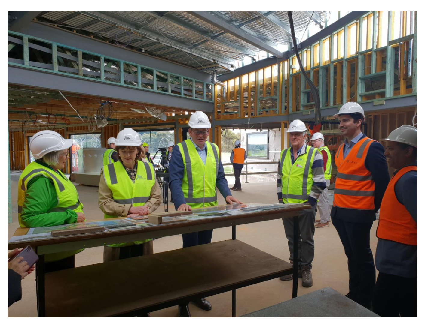
Figure 1: Cobaw Community Health, Kyneton

As a Company we are proud of the contribution we make to the community and environment in which we operate. We have a commitment to excellence and a charter which documents our approach to ethical and professional standards of behaviour and performance. Our management systems are accredited to ISO9001, ISO45001 and ISO14001. In addition, our HSEQ management system is accredited to the Federal Safety Commission OHS standards.