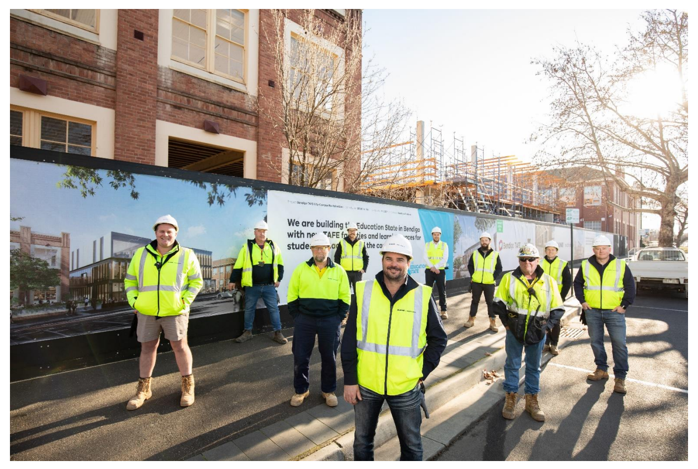
Bendigo Tafe Revitalisation Project