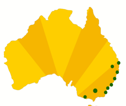
Figure 1: Our Project locations

This second Modern Slavery Statement is submitted by The Village Building Co. Limited (ABN 97 056 509 025) (Village) as