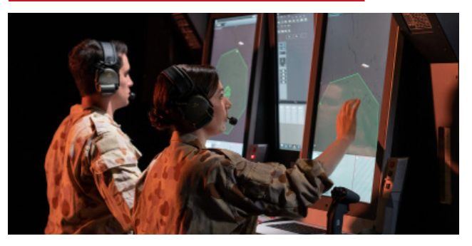
Figure 3: Raytheon Product Lines