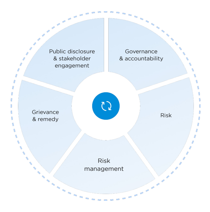
Figure 4. The five criteria assessed to address modern slavery risk

The review considered Altium current practices against five key criteria (depicted in Figure 4 below) and was based on Australian Government Guidance for Reporting Entities, United Nations Guiding Principles on Business and Human Rights (UN Guiding Principles), the Ethical Trade Initiative, International Labour Organisation outputs, as well as relevant industry reports and market practice examples.