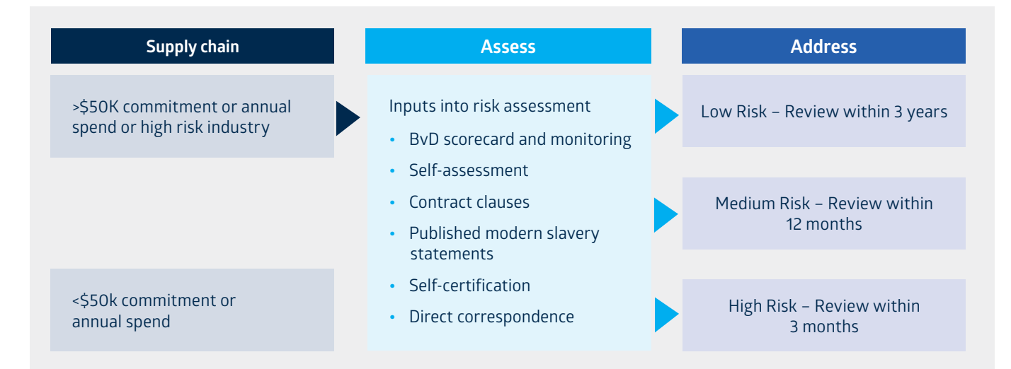
FIGURE 4: ASX APPROACH TO ADDRESSING MODERN SLAVERY RISK