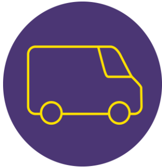
Brand carry & Promotion